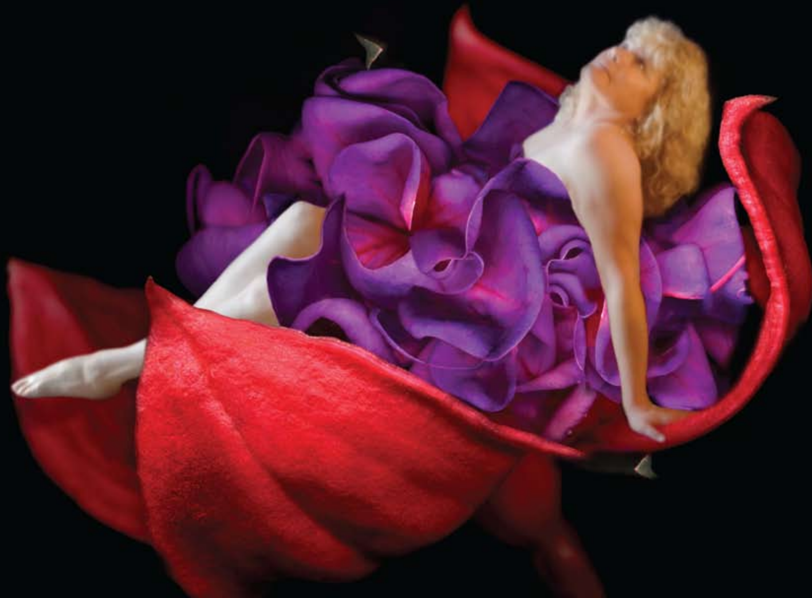
Linda Burkhart lounges in Fuschia